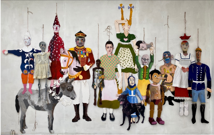
Unsung Heroes, various techniques and dimensions