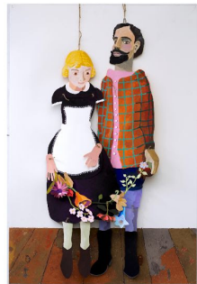
Full Moon, 2024 | Topsy Turvy Two, 2024 | Botanical Beauty, 2024

The gallery features a group of works originating from the Stadtmuseum München, where an entire floor is dedicated to the history of the Bavarian Puppet Theatre. A walhalla for