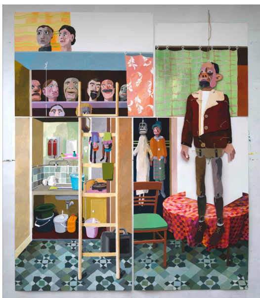
Hinterzimmer, 2021, gouache, pencil and sisal rope, 242 x 202 cm